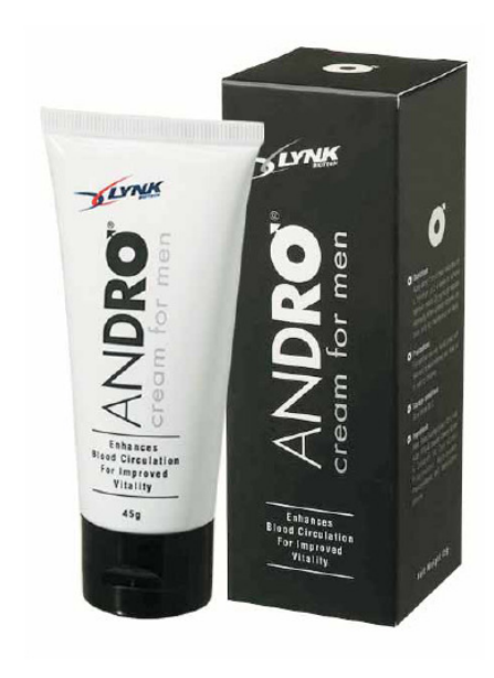
ANDRO® Product Shot